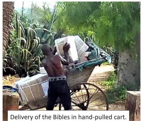
Delivery of the Bibles in hand-pulled cart.

Want to help promote FOMM? Become a FOMM Ambassador! Promote our work in a way that is comfortable to you: speak to family/friends/congregations or any other way in your comfort zone. You will receive quarterly updates, printed materials and power point presentations.