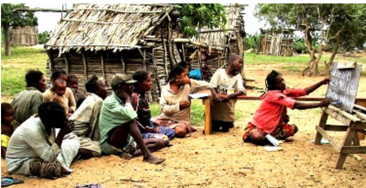
Teaching people to read, so they will be able to read the Bible (see p. 6 for more details).