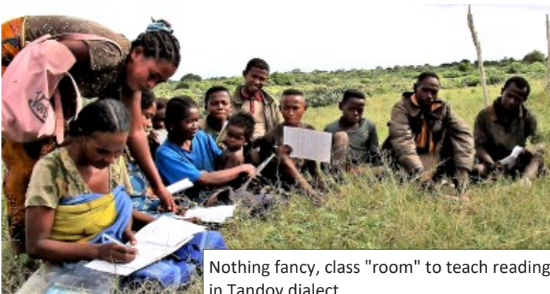
Nothing fancy, class "room" to teach reading in Tandroy dialect.