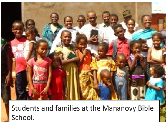
Students and families at the Mananovy Bible School.

Total 2018 Financial Support Sent: $30,500.00