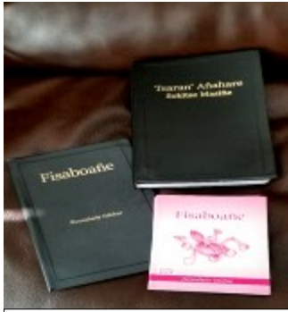
Copies of the Tandroy Bible, large hymnals and pocket hymnal.

Total 2018 Financial Support Sent: $92,100.00