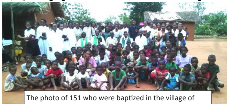
The photo of 151 who were baptized in the village of Ambatomanga. Read the full story on FOMM's web site.

Analysis: Currently in 2018 we have supported 43 evangelists. This program is always fully funded by faithful, loyal congregations and individuals who are assigned to support a specific evangelist at $700.00 a year.