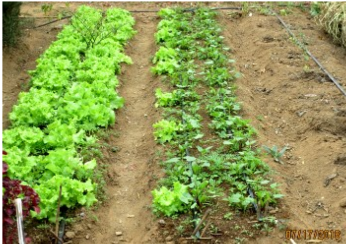
Vegetables in a Drip Irrigation garden.

Analysis: Life in Madagascar is very difficult when compared to our life style in America. We expect immediate results and receive them from electronic communication, ordering items for delivery to our homes, picking up ready-made food, flipping a switch and the heat or cooling comes on, etc. None of this describes life in Madagascar. I share this thought with you because the Drip Irrigation Program has not been fully established as we had planned. It is not because they are not motivated. It is because it is hard to get all the parts of the program in place. It will happen, but on Malagasy time, and not by our American time table. So, we invite you to pray that the program will move forward in 2019.