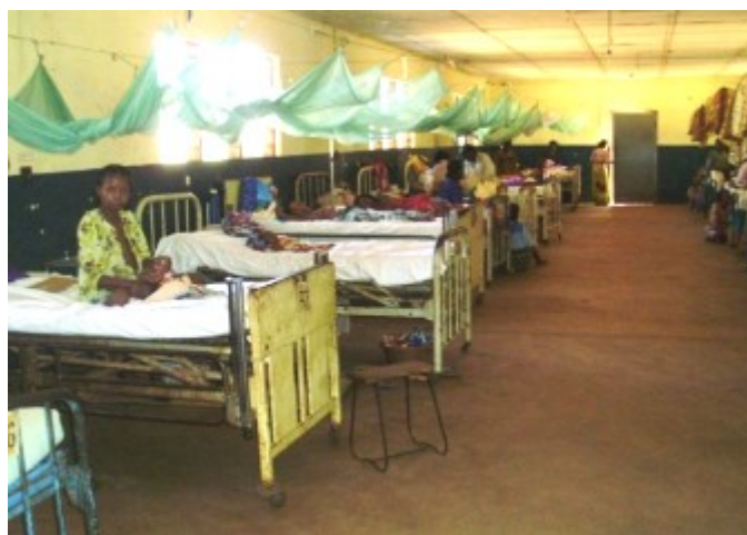
The women's ward at Ejeda Hospital.