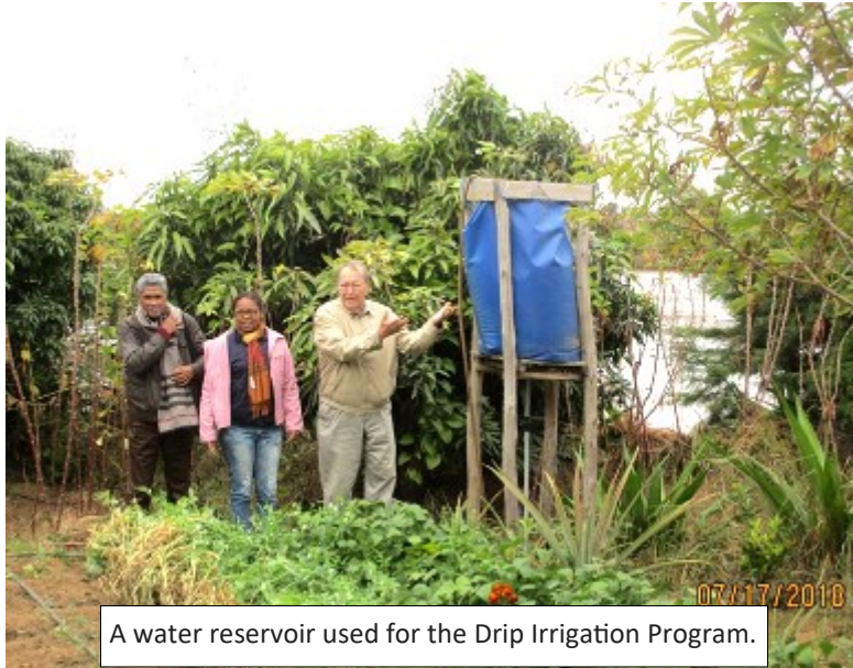
A water reservoir used for the Drip Irrigation Program.

Total 2018 Financial Support Sent: $5,000.00