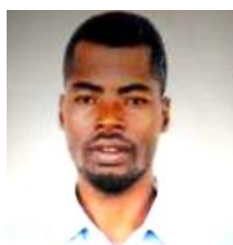
FOMM's New Coordinator in Madagascar

Over the past 3 years, FOMM's organization has grown through expanding the role of the board, developing a staff of 5 persons who receive no pay or benefits and now expanding the programs and projects in Madagascar. For better management and greater relationships with our partners in Madagascar, we have decided to employ a coordinator in Madagascar. This means we must pay a person's salary, office/equipment and travel for this position. If you would like to help support this position, a gift of any amount may be given. We are estimating a cost of $10,000.00 in 2023.