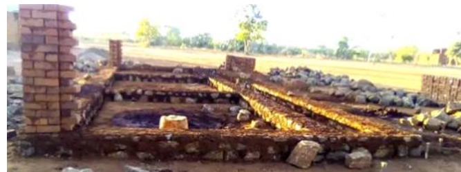
Building a foundation for a new housing unit at the Mananovy Bible School

These schools are important for the training of evangelists and catechists who are at the forefront of proclaiming the Gospel to those who do not know of God's marvelous love through Jesus Christ. Two of the schools are having major building rebuilding projects. At the Manasoa Bible School the campus is being totally rebuilt and solar energy equipment being installed through the generous gifts of FOMM donors. A cyclone damaged/destroyed two main buildings on the Manantantely Bible School campus and they too are being rebuilt through a generous donation from a FOMM donor.