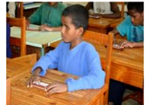
A boy learning to write and read braille