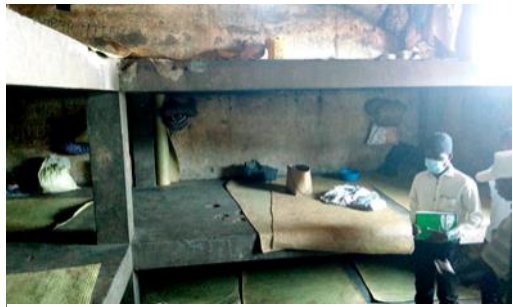
A cell for children prisoners at the Antalaha Prison

Children are in this prison because they have stolen vanilla beans. The children are paid a small amount of money to go into the vanilla fields and steal the vanilla beans. Vanilla is the major export crop in Madagascar and in this area is the major industry. Madagascar uses the French judicial system which means when a person is arrested for a crime, they go directly to a prison. There is no pretrial or bond system, and so one has to wait for a time to appear before a judge. This may take weeks, months or even years and so a prisoner waits in a prison. The children, against all international laws, remain in