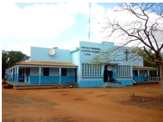
Ejeda Hospital Campus

It is difficult for us to comprehend what it is like to live in a region of the world where people suffer from the constant threat of drought and starvation. In such a climate, Ejeda Hospital exists and ministers spiritually and medically. A gift to this program is probably one of the most fulfilling ways to support a FOMM program because you are proving food, medical help and a word of hope through the Gospel!