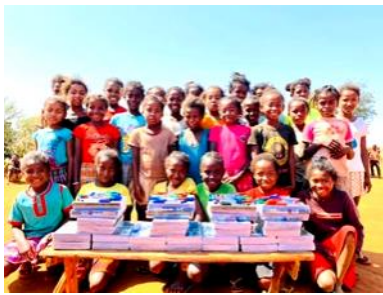
Young students receiving their school supplies

It is a “dream of the Androy girls” because education is not always valued, especially for girls. This tutoring educational program seeks to keep the girls in public school and encourages receiving as much education as possible. Currently there are over 350 girls in the program. The number increases every year as parents see this program as a way to save their girls from a life of poverty. A sponsor receives a photo and a bio of the girl you are assigned plus two letters a year.