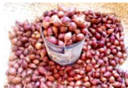
Onion seeds are one of the crops grown in this region

Throughout the long past four years of drought and famine, the people have planted crops only to have them dry up due to no rainfall. In this period of drought, the people have eaten the seeds that were supposed to be saved for planting the next year. Now when it rains again, there is a need for seeds to plant. The church develops programs for the distribution of the seeds to those who are in the most need.