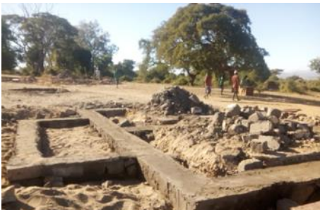
Old buildings were demolished and ready for construction of a new building at Manasoa Bible School.

FINANCIAL INFORMATION: Due to the poverty of the region where the Bible Schools are located, the FOMM Board decided to increase the annual support of each Bible School by $1,000.00 in 2023. The cost for construction (and installation of solar power) at the Manasoa Bible School is $140,000.00 and the repairs for damage at the Manatantely Bible School from a cyclone in mid-2022 is $32,000.00 (The ELCA Central Southern Synod has also provided funding through FOMM for this project). All the money for these construction projects has been raised. A thank you to all of the gracious gifts from the donors!