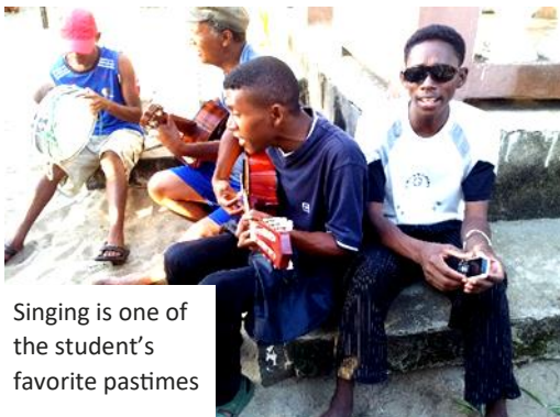
Singing is one of the student's favorite pastimes

Annual cost of a residential student at the FOFAJA School for the Visually Impaired is (USD $586.00) . A donor may provide a full scholarship or one half (USD $293.00) or one quarter (USD$146.50) . We would encourage an annual renewal of your support. A donor will receive: 1) A photo of the student, 2) A biography of the student and 3) A letter twice a year informing the donor of the student's progress.