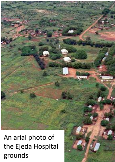
An arial photo of the Ejeda Hospital grounds

past 4 years, there has been a severe drought in this region and this program has been particularly important.