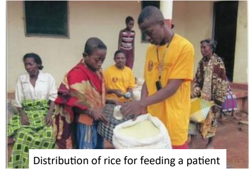
Distribution of rice for feeding a patient

The hospitals in Africa do not have food service, so a family member of the patient must stay with the patient and provide for their meals. If a family does not have a supply of food, they will not bring the sick patient to the hospital. So Ejeda Hospital has a Nutrition Program to provide rice and a protein for these patients without food. In the