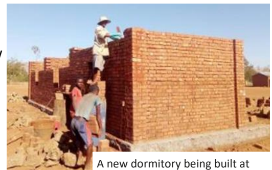
A new dormitory being built at the Mananovy Bible School.

To learn more about the Bible School Ministry program and how you may support this project, go to our web site at: www.MadagascarMission.org and click on "Get Involved/Projects"