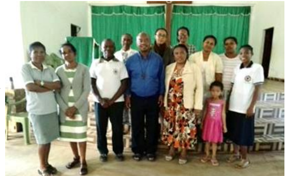
A team being trained to lead the ministry at a prison.

FINANCIAL INFORMATION: The cost for the prison ministry in 2022 was $80,000.00 . In 2023 we are increasing the funding to $86,000.00 in order to begin 5 new prison ministries.