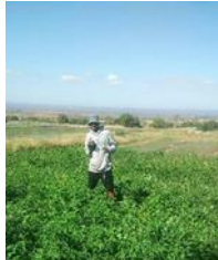
A lush field irrigated through drip irrigation

solve this mega problem which can only be solved by governments and big corporations. But we believe we can show in our small ways that there are solutions to this issue. So, we are providing water projects: 1) A Drip Irrigation Teaching Center at two locations, Ejeda Hospital and Manasoa Bible School to teach people how they can raise crops even in times of drought. 2) We are working on two ways to provide water in cooperation with other agencies/non-profits to reduce the costs. A) We are working with Madagascar Water Project to reclaim wells that are not producing and in 2022 reclaimed 29 wells at an average cost of $1,500.00 . Each well serves an average of 1,500 persons. B) Secondly, we are preparing to dig two deep wells that will produce large volumes of clean water. The cost averages $20,000.00 each. To date we have received funding for two wells. One is from a small, but vibrant mission focused congregation of 100 members who in 9 months raised support for one well, Vernes Lutheran Church, Fosston, Minnesota and the second well from an individual couple who wishes to remain anonymous.