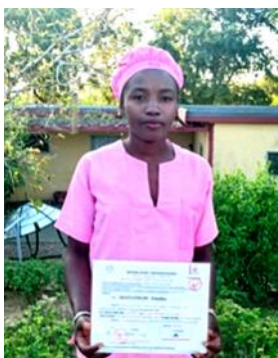
A graduate from a program to work as a midwife.

Born into a culture that does not value education for girls, Nofy i Androy exists to help girls beginning at the 5 th grade to stay in school and even continue their education at a university or trade school. The success rate for this program is very high and more girls are taking advantage of this educational program. FOMM has assigned a female evangelist from the Ambovombe Androy Synod to work within the program to teach the Christian Faith to the girls, counsel with the parents and girls to encourage them to stay in the program.