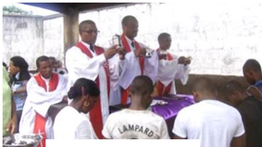
A worship service in a prison

In addition, in 2023, we are beginning to support the Antalaha Children's Prison Ministry. Children in this region are caught stealing vanilla beans, which currently have great value. The children are hired for "pennies" to steal the beans. But they are often caught and in Madagascar they go directly to the prisons because the "French legal system" claims guilty until proven innocent. It then takes months and even years to have their day before a judge. We will also be providing legal help to these children. To learn