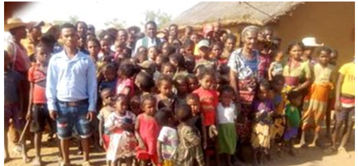
A photo of a new group of Christians as a result of an evangelist's work.

FINANCIAL INFORMATION: The cost to support an evangelist is $800.00 a year (Salary, education fund and health care). The donors receive a bio and photo of the evangelist. In addition four quarterly reports on their work are sent to the donors. In 2023, FOMM is giving each evangelist an extra gift of $50.00 from undesignated giving. To learn more about the Evangelist Program, go to our web site at: www.MadagascarMission.org and click on "Get Involved/Projects".