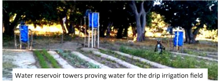
Water reservoir towers proving water for the drip irrigation field

Water is an absolute necessity for life! So how do you live when you do not have water (or clean water) to drink or to grow your crops? Millions of Malagasy people live with a lack of adequate water, most in the south west part of Madagascar where we support most of our programs. We realize that FOMM can not