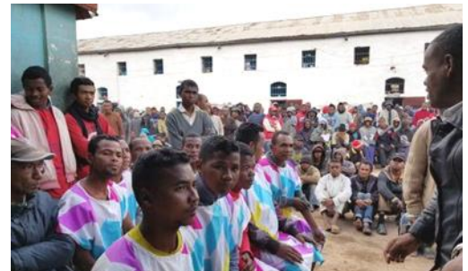
A worship service, singing group