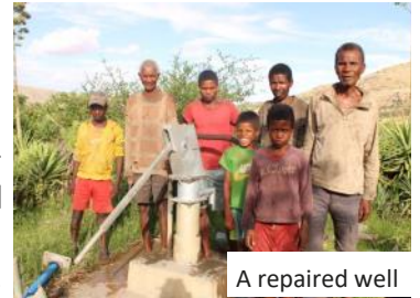
A repaired well

solve this mega problem which can only be solved by governments and big corporations. But we believe we can show in our small ways that there are solutions to this issue. So, we are providing water projects: 1) A Drip Irrigation Teaching Center at two locations, Ejeda Hospital and Manasoa Bible School to teach people how they can raise crops even in times of drought. 2) We are working on two ways to provide water in cooperation with other agencies/non-profits to reduce the costs. A) We are working with Madagascar Water Project to reclaim wells that are not producing and in 2022 reclaimed 29 wells at an average cost of $1,500.00 . Each well serves an average of 1,500 persons. B) Secondly, we are preparing to dig two deep wells that will produce large volumes of clean water. The cost averages $20,000.00 each. To date we have received funding for two wells. One is from a small, but vibrant mission focused congregation of 100 members who in 9 months raised support for one well, Vernes Lutheran Church, Fosston, Minnesota and the second well from an individual couple who wishes to remain anonymous.