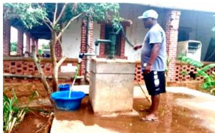
The restored water reservoir built by the missionaries