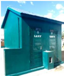
Bathrooms and showers