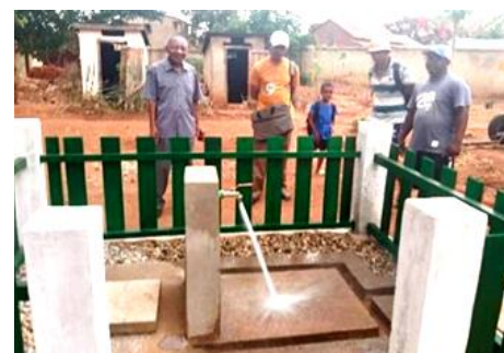
The synod water station