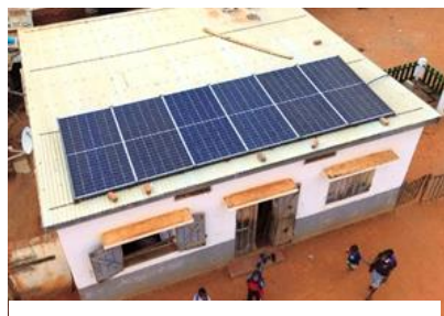
An photo of solar panels on the school roof to power the water pump.