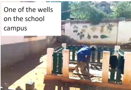
One of the wells on the school campus