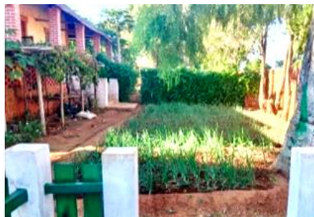
Synod Office gardens