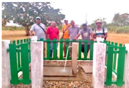
The high school water station