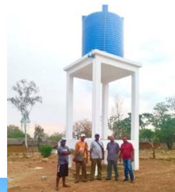
Water tower for the water distribution system