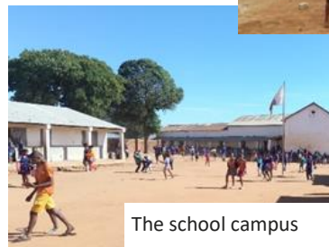
The school campus