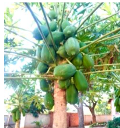
Synod Office gardens