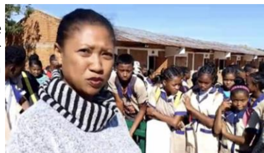
The school director with students